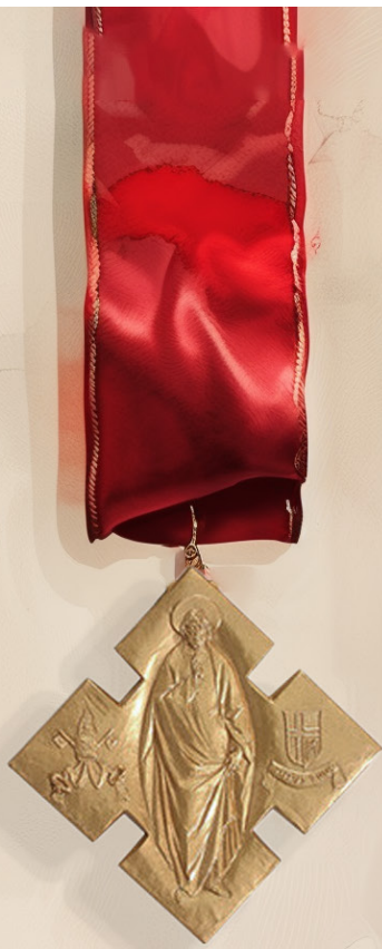
THE BENEMERENTI MEDAL