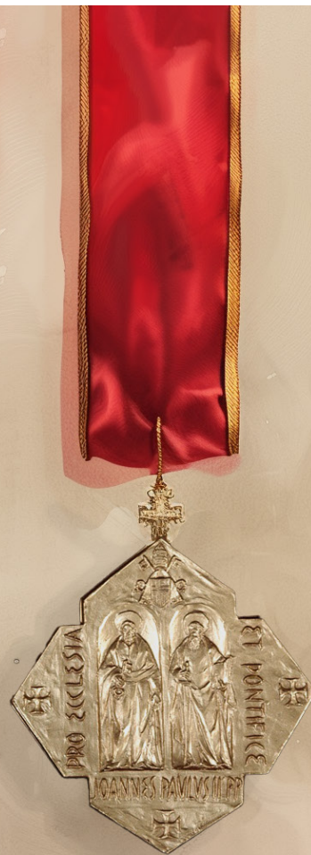
THE PRO ECCLESIA ET PONTIFICE CROSS