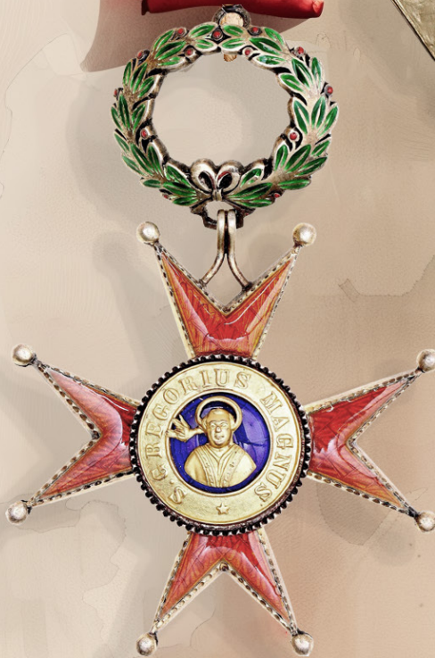
THE ORDER OF ST GREGORY