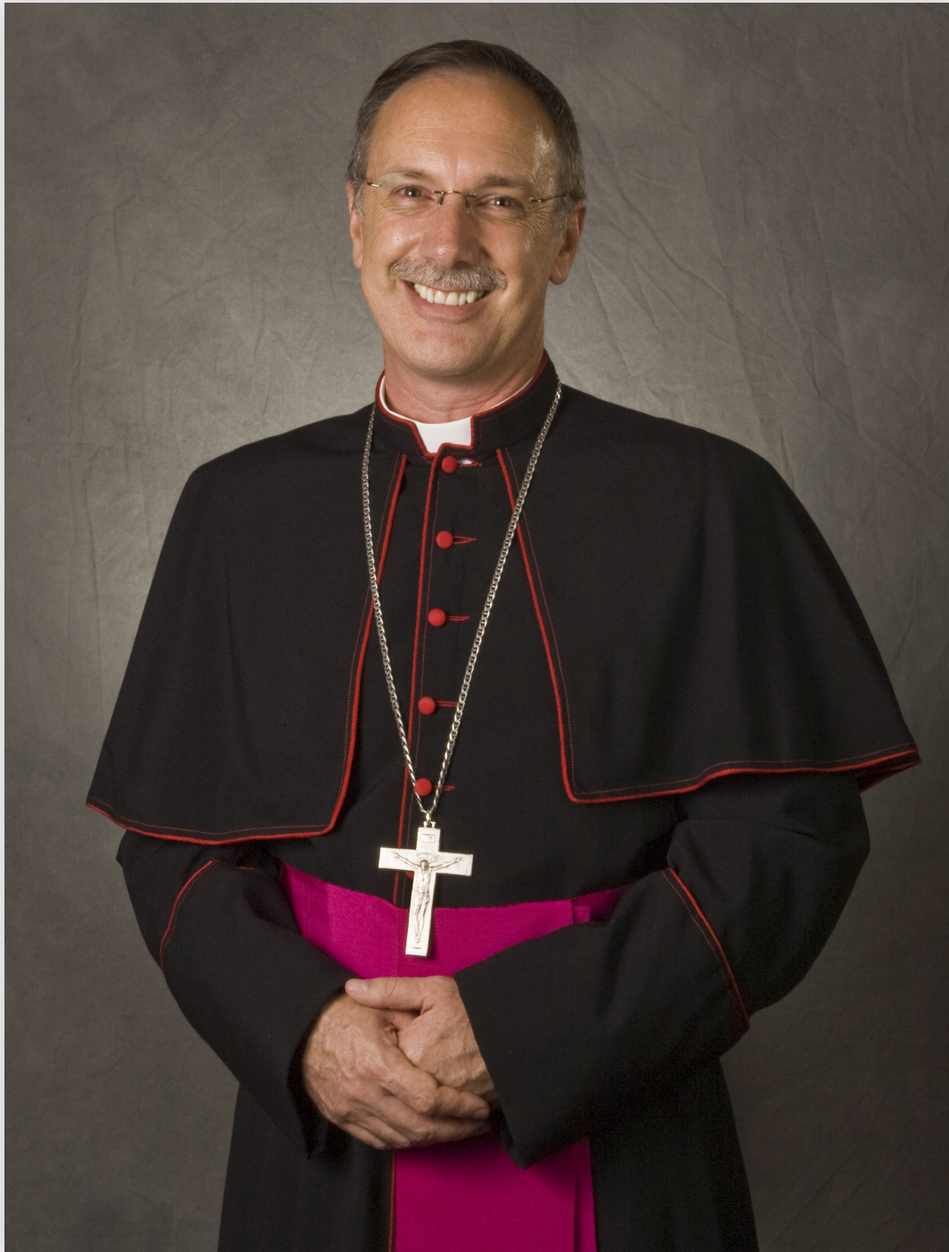
BISHOP OF RALEIGH